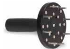
ET5040C-0004 Die Installation Tool

Die installation tool provides quick die change out capability for all standard, and 430"U" style dies.