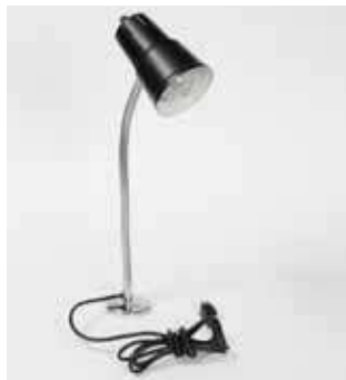
ET4001C-0017 Magnetic Work Lamp

Versatile magnetic work lamp can be mounted in multiple locations, providing additional light to improve visibility while crimping assemblies.