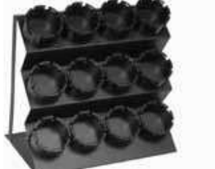
ET5040C-0016 Table Top Die Storage Rack

Table top die storage provides flexible storage in the shop and allows placement of dies where easy access and space are available.