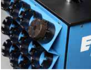
ET5040C-0014 Machine Mounted Die Storage Rack

Machine mounted die storage rack provides quick and easy access to crimp dies, resulting in improved setup time and crimp speed.