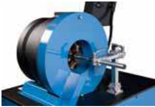
ET5040C-0007 Manual Backstop

Manual backstop ensures crimp length and position are set for consistent and repeatable crimps each and every time.