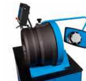
ET5040C-0009 Viewing Mirror

Machine mounted viewing mirror provides additional line of site to the crimp head to assist with fitting alignment and crimp location.