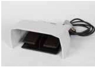
ET5040C-0020 Double Pedal Foot Switch

Double pedal foot switch provides hands free operation of the crimp head, allowing for both crimp and retract during operation.