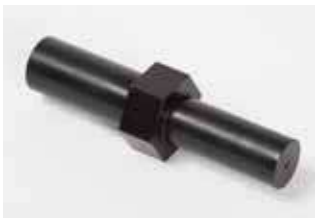
ET5040C-0019 Calibration Tool

Calibration tool simplifies the calibration process to ensure the ET5040 crimp machine is achieving consistent and accurate crimp diameters (supplied with machine).